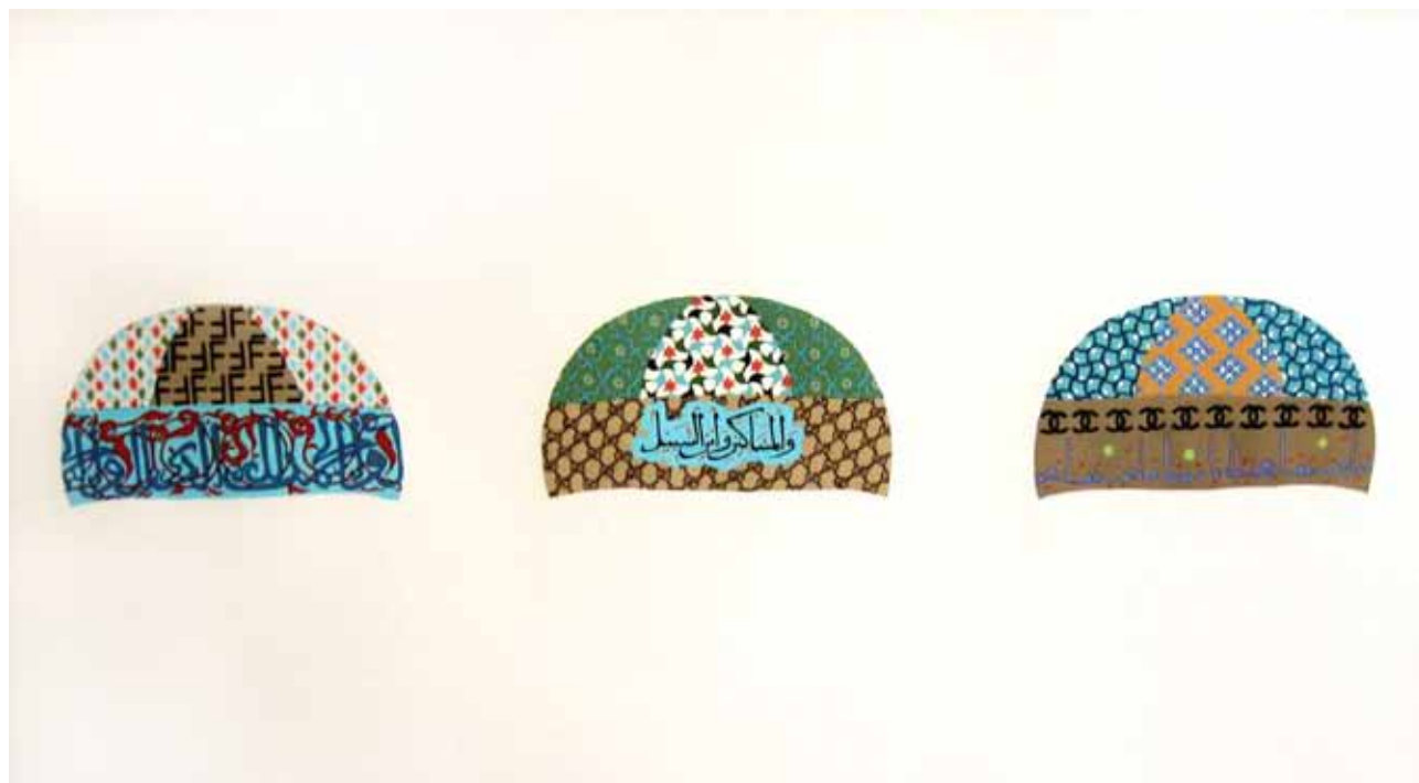
Triple Skullcaps - Headgear series , 2007, Gouache on paper, 114x147cm - Courtesy of the Artist and The Third Line gallery.

Pouran Jinchi's distinct contemporary approach to calligraphy and Persian poetry makes her unique among several visual artists working in this realm today. Born in Iran and based in New York, Jinchi's paintings are a blend of meticulously penned verses and words from such master poets as Omar Khayyam (12th century) and Hafez (14th century), religious texts, Minimalism and East Asian sensibilities. For as long as she remembers, the versatile shapes and forms of the letters of the Arabic alphabet have captured her imagination. To her each letter is not only a signifier of sound or meaning, but also a form with a life and energy of its own. Using calligraphy as a point of departure, her works take this medium to new levels and in new directions.