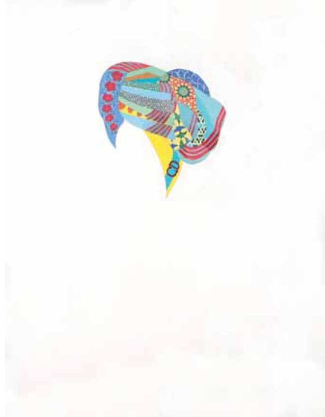
Christian Dior - Headgear series, 2007, Gouache on paper, 76x58cm