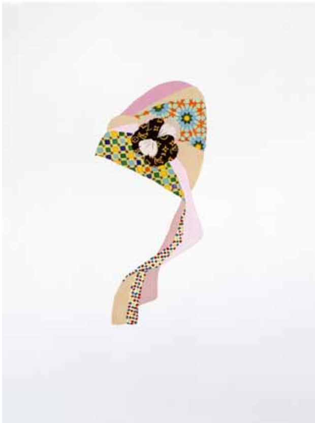
Louis Vuitton Flower - Headgear series, 2007, Gouache on paper, 76x58cm